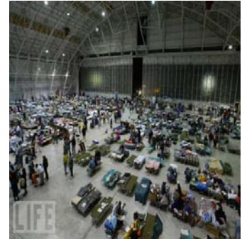
Image of an evacuation site during times of a disaster

U.S. Department of Transportation, Office of the Secretary. This webinar stressed the importance of having available transportation accessible for students and people with disabilities during evacuation. It is vital that individuals with DD be evacuated with their wheelchair and/or durable medical assistance as this is part of the individuals’ identity, independence, mobility and means of support.