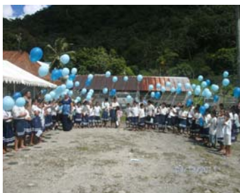
Coleman students and teachers lining up to launch Balloons

April is National Abuse Prevention Awareness Month, a time to raise awareness about child abuse and neglect and create strong community support for children and families. The University Center for Excellence on Developmental Disabilities (UCEDD), partnered with Child Protective Services (CPS) at the Department of Human Social Services (DHSS) to host the Child Abuse “Balloon Launch” activity at Coleman Elementary School on April 14th,