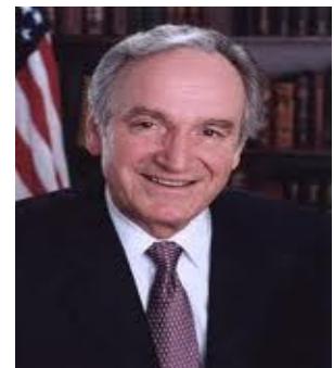
A photo of Senator Tom Harkin (D) from Iowa State

abilities are leaving the labor force during this recession at more than 10 times the rate of adults without disabilities. Harkin called on the CEOs and business owners in the audience to join him in his goal of increasing the number of disabled Americans in the workforce from 4.9 million today to 6 million in 2015.